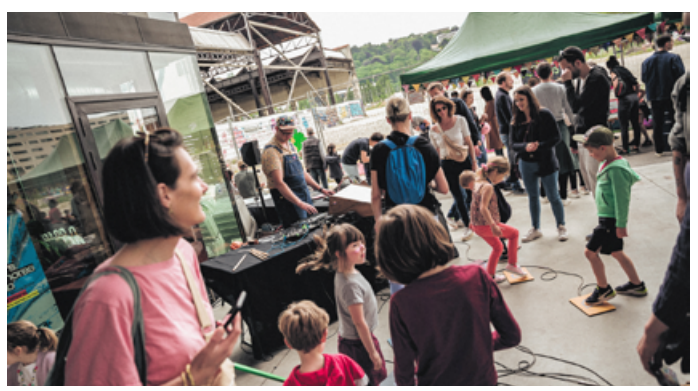
That same feeling of urban effervescence was also rekindled by the return of the Extra! programme , which presented 15 celebratory artistic projects by cultural actors from the local area...

Following a three-year absence, Nuits Sonores joyfully returned to the public space with specially curated free events at the Place Guichard, Le Transbordeur and the forecourt of Le Gros Caillou. The aim was not only to bring music to the streets, but to shine a light on the role played by the Guillotière district in the history of Raï music and showcase the ways in which artists on today's electronic scene are reviving this heritage. Meanwhile, in the Croix-Rousse neighbourhood, Dom Peter (founder of the High Tone group and the Blanc Manioc label) and the Maraboutage collective rekindled the multicultural history of their surroundings. Here as elsewhere, festival-goers rubbed shoulders with local residents in a celebratory and good-natured atmosphere. Images such as these, capturing scenes of jubilation in public spaces and at the various sites that make up the festival, were also exhibited in situ in the city as part of the 20 Sleepless Years exhibition, a retrospective exploring the festival's urban footprint.